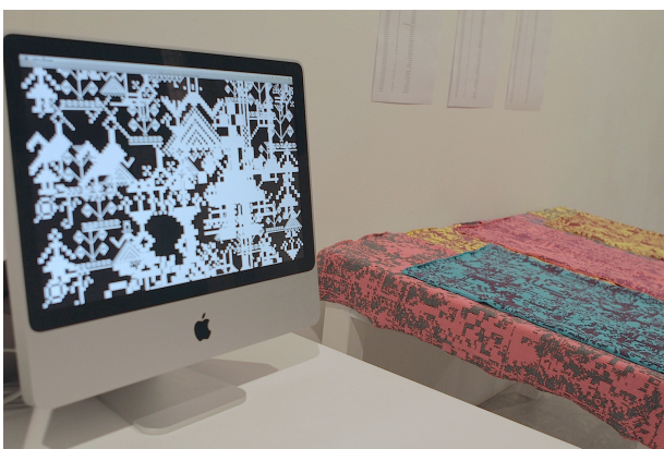
Figure 1: Detail from the Oiko-nomic Threads Installation.

Contemporary computers are direct descendants of the Jackard's loom—an industrial era machine that used punched cards as a way of calculating and representing numerical data to be subsequently transformed into weaving patterns (Essinger, 2004)—and of Babbage's Analytical Engine, which employed a variation of the same system to perform complex probabilistic calculations (Swade, 1991). In that vein, Ada Lovelace foresaw the future application of programming as the means to realise computer-generated music and graphics (Charman-Anderson, 2013) and this way prepared the grounds for the entire informational revolution to follow. Weaving is, hence, to be understood as a constitutionally algorithmic process, which has henceforth evolved in parallel to computer technology. In that vein, contemporary fabrication tactics, such as those suggested by Hatch (2013), constitute a platform for the further development of new technologies and/or for the re-appropriation of existent ones. A re-conceptualisation of the design process through data visualisation and parametric design schemata is cast possible this way (Romano & Cangiano, 2014, pp. 170-172).