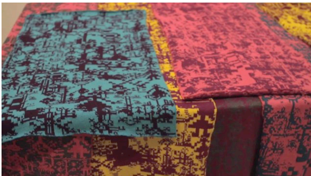
Figure 3: Algorithmically generated textiles.

Technically, the installation revolves around the fabrication of a generative textile in real-time; a task conducted both by means of algorithmic computer instructions as well as via human interaction. The decoration of the fabric has been conceived as a machine-intended interpretation of a numerical database—representing the financial activities of the Greek National Manpower Employment Organisation—through another—a series of digitised folk patterns typically used as decorations in woven textiles, see e.g. Figure 2. On a conceptual level, these two datasets connote different kinds of economical models—domestic-based economy versus capitalism. The decoration is, then, to be realised by means of sophisticated software (coded in C++) and with the aid of custom hardware designed specifically for the project. Note that the decoration is also bound to be affected by various glitches congenital to the hardware itself or due to inaccuracies on the operator's behalf—this is totally desired and in accordance with the project's thematic axis; it may be understood as a way to foreground particular qualities of the technology in use.